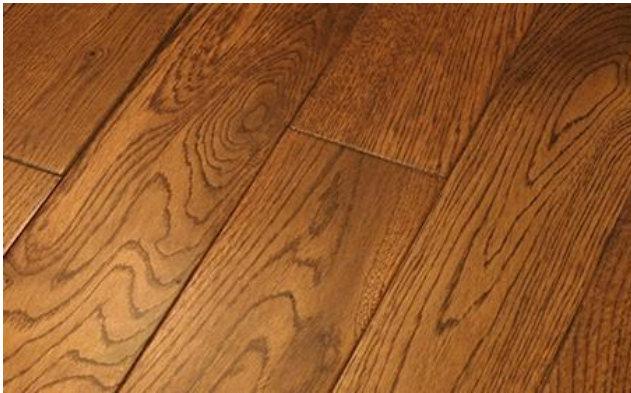
Inner decoration( many Options)